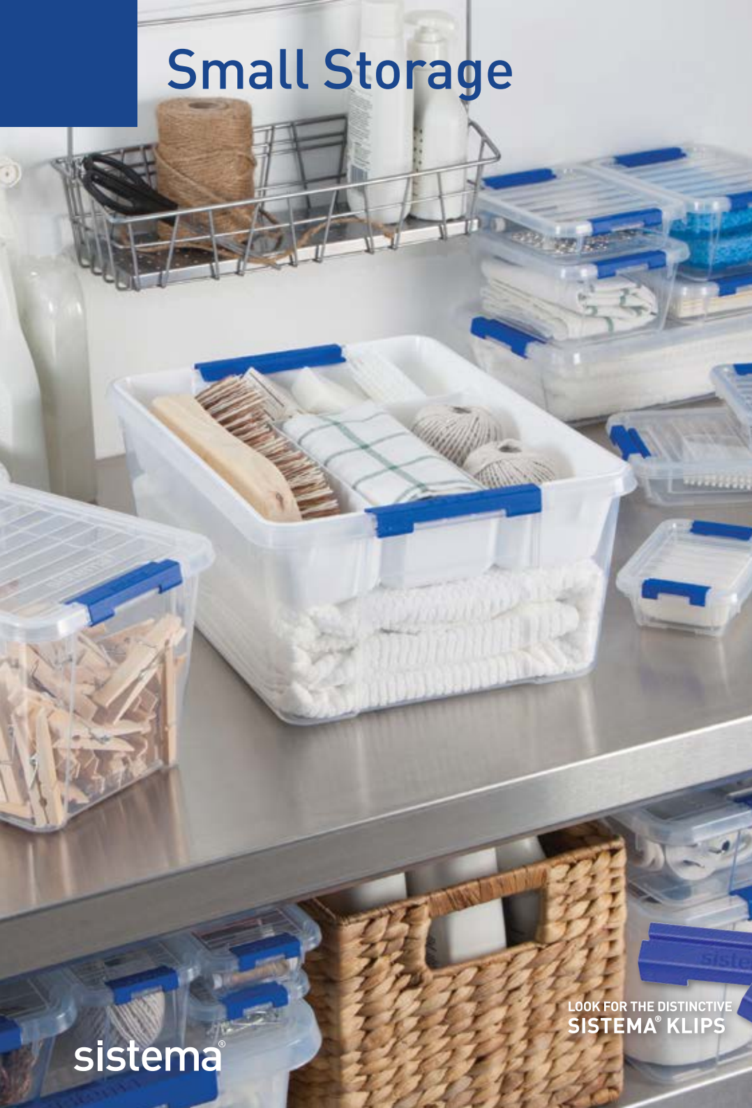
Style 70001 175ml