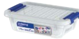
Style 70003 375ml