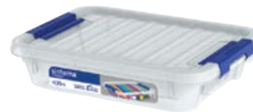
Style 70008 810ml